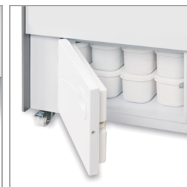
Easy access storage compartment