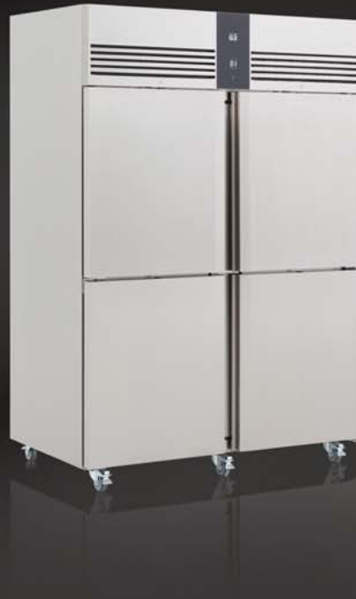
EP1440H4 Half Door Refrigerated Cabinet