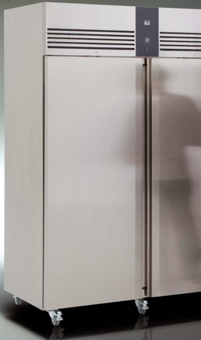
EP 1440H Refrigerated Cabinet