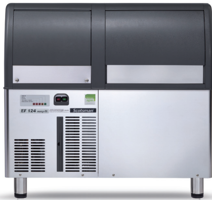
Routine Maintenance Alarm