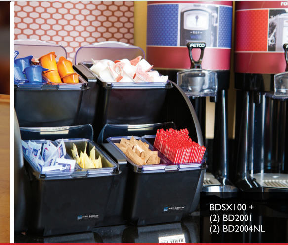
BDSX100 + (2) BD2001 (2) BD2004NL

BAR RAILS SALAD STATIONS BEVERAGE CENTERS CONDIMENT COUNTERS COFFEE AREAS