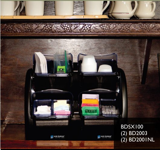
BDSX100 (2) BD2003 (2) BD2001NL