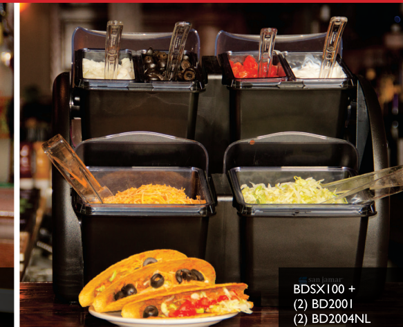
BDSX100 + (2) BD2001 (2) BD2004NL