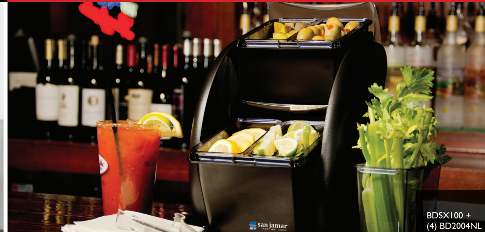
BDSX100 + (4) BD2004NL