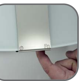
Discreet undermounted controls