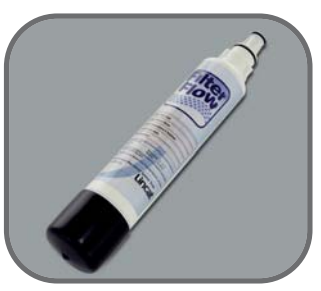
Convenient easy-change filter

• Unique built-in filtration system – convenient and cost effective • Sleek design with choice of black or white glass finish • Compact - ideal for siting over draining boards or sinks • Flush wall-mounted design - no unsightly support brackets • Adjustable temperature between 70° and 96° – perfect for speciality teas • Cool-to-touch 8mm thick toughened glass fascia to withstand hard knocks • Reliable electronic temperature control system ensures economical operation