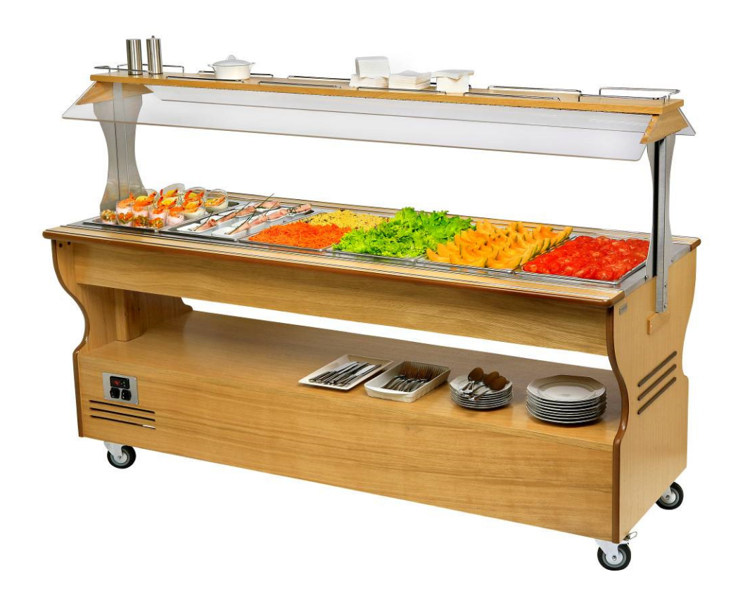
Made in France