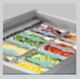
Designed to accommodate gastronorm containers in pan holders for good kitchen organisation (max 150mm depth).