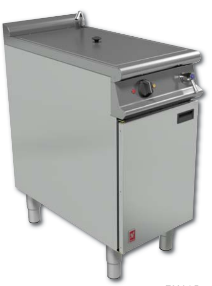
E3204 Pasta Boiler

Their countrywide network of engineers are on standby to meet all of your servicing, maintenance and spares requirements.