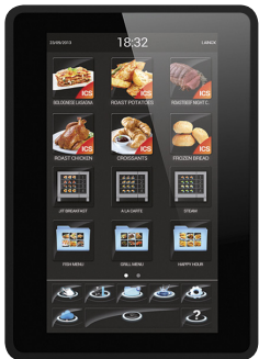
LCD 10" Touch Screen