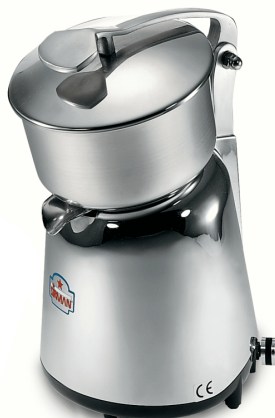
Sirman Citrus Juicers , model Apollo Con Leva :

Authorized Distributor: FOODSERVICE EQUIPMENT MARKETING 10 CARRON PLACE-KELVIN IND. ESTATE G75 0YL GLASGOW() TEL./FAX. 0044-1355 244111 / 0044-1355 241471 E-mail: saganm@fem.co.uk