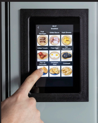
User-Friendly Touch Screen Display