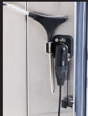
Multipoint Core Probe Included