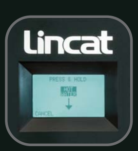
Place cup/mug, press and hold to fill to desired measure