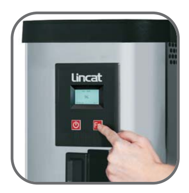
LCD panel keeps you informed

Routine maintenance of your FilterFlow automatic water boiler couldn't be easier. Access to all internal components is gained simply by removing the lid and front panel. FilterFlow boilers require much less descaling, but when this is required, the process is quick and straightforward – and there's no need to move the boiler from its normal position.