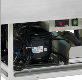
Automatic evaporation of defrost water