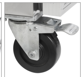
Strong wheels as option