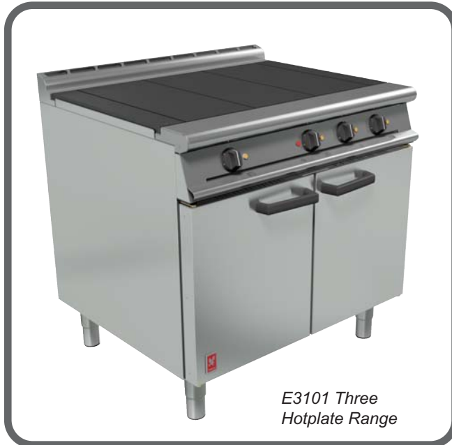
E3101 Three Hotplate Range