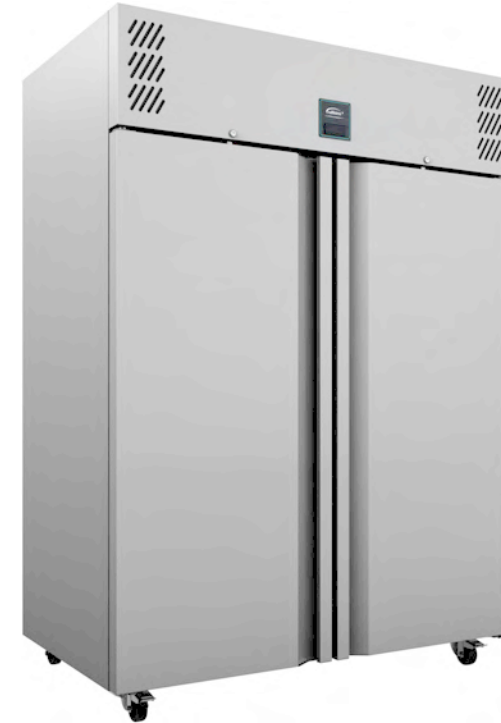
HJ2SA HC R4