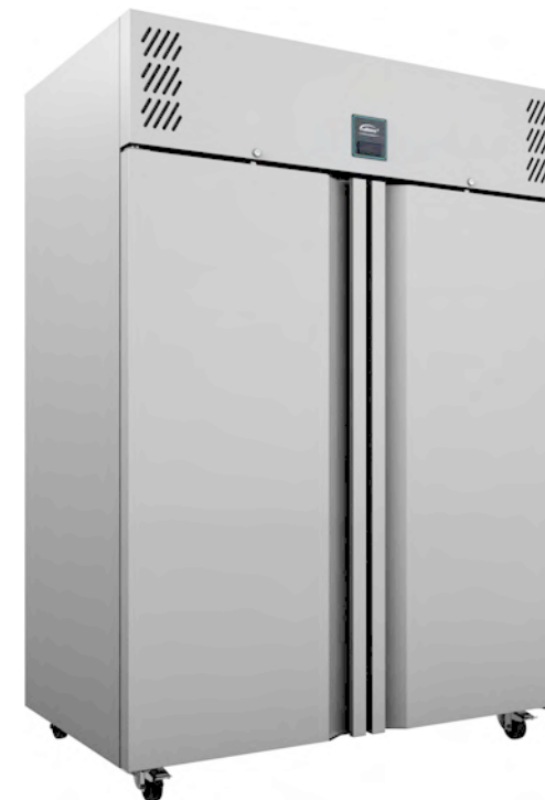
LJ2SA HC R3