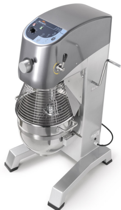
Sirman Planetary Mixers , model Plutone 30 :

Sirman Spa Viale dell'Industria 9/11 35010 PIEVE DI CURTAROLO (PD), Italy Tel./Fax. +39 049 9698666 / +39 049 9698688 email: info@sirman.com