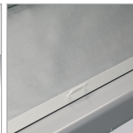
Rear night curtain to maintain temperature