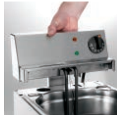
Control head fits securely in place