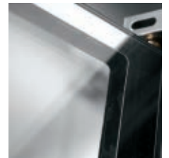
Energy-efficient double-glazed door