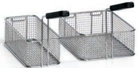
Supplied with nickel-plated wire mesh baskets