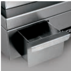
Large fat collection drawer