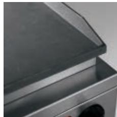
One-piece cast iron griddle plate