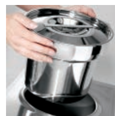
Supplied with stainless steel round pots