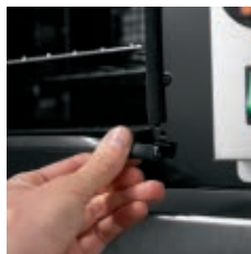
User-replaceable door seals