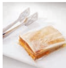
Optional toasting bags (TO10)