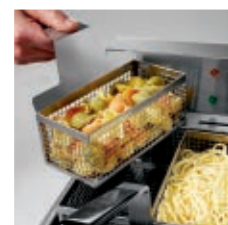
Optional half-size basket inserts (BA158) for cooking individual portions