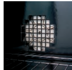
Efficient fan gives fast, even cooking