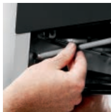
User-changeable quartz infra-red elements