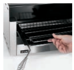
Model LGT supplied with grill pan and toasting rack