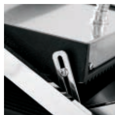
Retaining mechanism holds plate in perfect position