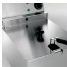
All Lynx 400 fryers are supplied with lids