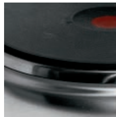
Sealed hotplates for easy cleaning