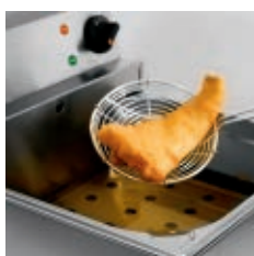
Large tank in LFF is ideal for free frying