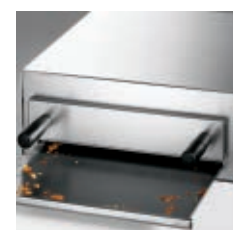
Large crumb tray for easy cleaning