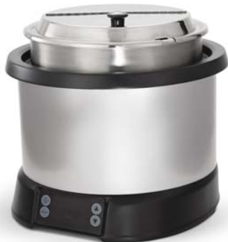
Mirage® Induction Countertop Rethermalizer