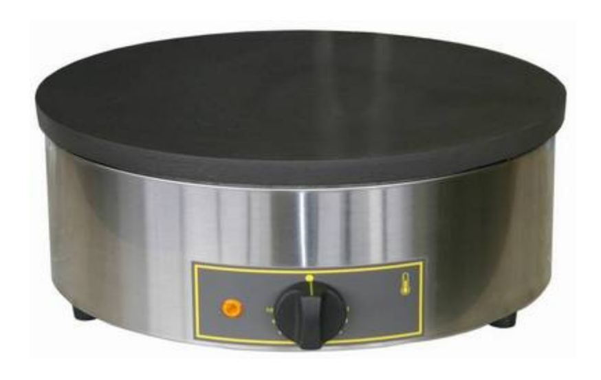
Made in France