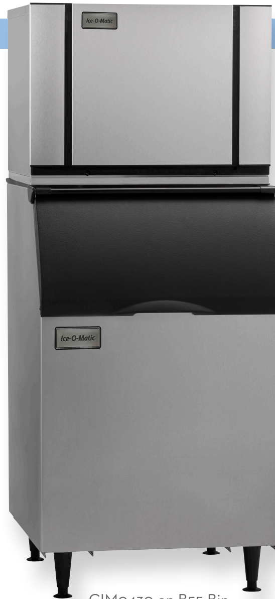
CIMo430 on B55 Bin

No bottle brushes required. Easily removed and disassembled for cleaning. Dishwasher safe.