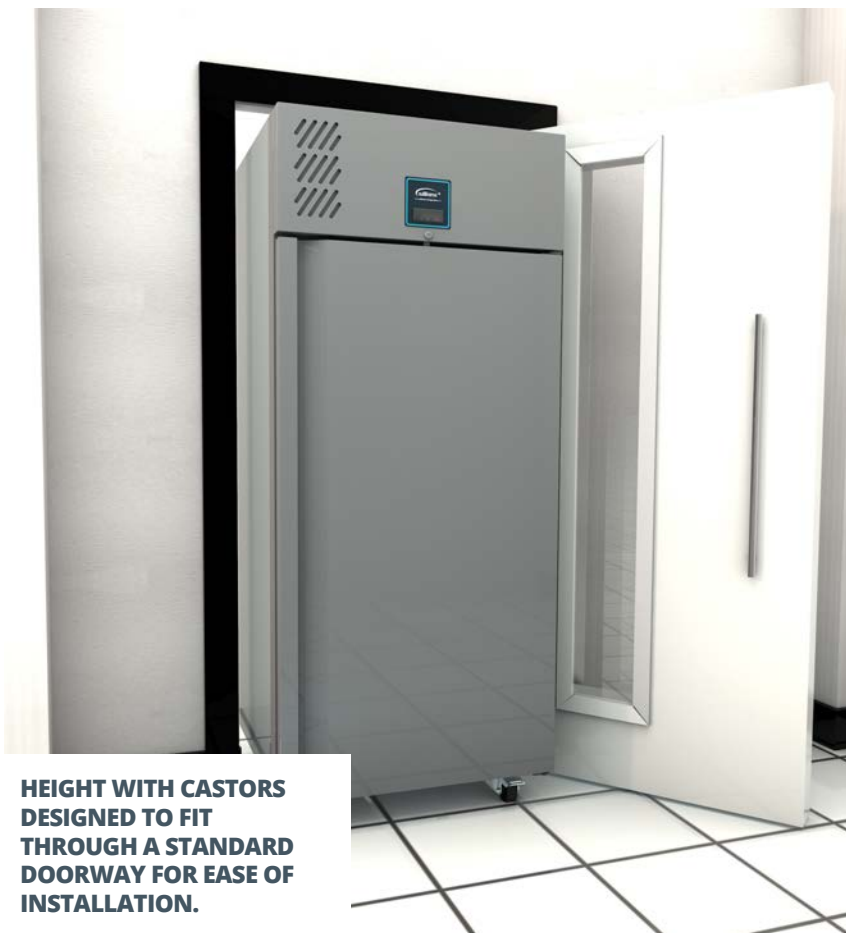
HEIGHT WITH CASTORS DESIGNED TO FIT THROUGH A STANDARD DOORWAY FOR EASE OF INSTALLATION.