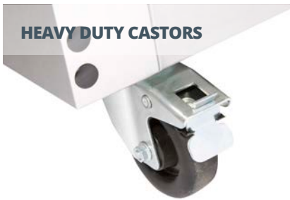
HEAVY DUTY CASTORS