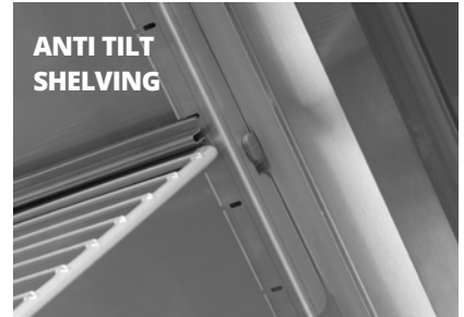
ANTI TILT SHELVING