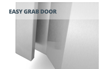
EASY GRAB DOOR