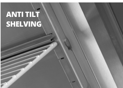
ANTI TILT SHELVING